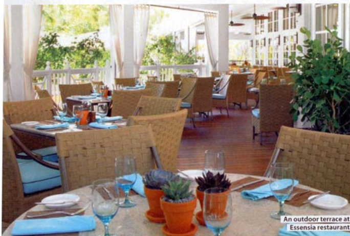
An outdoor terrace at Essensia restaurant